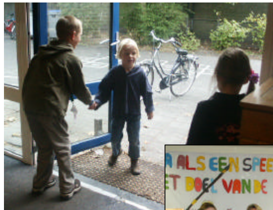
Left: The Greeters at Children's Church are children.

BIC: GENODED1HBO IBAN: DE36 3816 0220 4503 0430 12