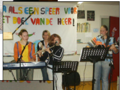
Right: The Church Teens lead Praise & Worship in Children's Church.